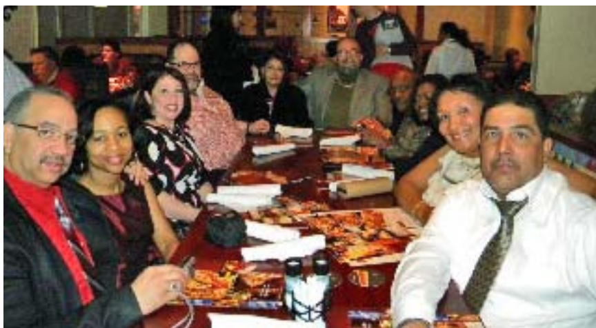
Couples from the Hispanic Congregation enjoy dinner together on St. Valentine's Day.